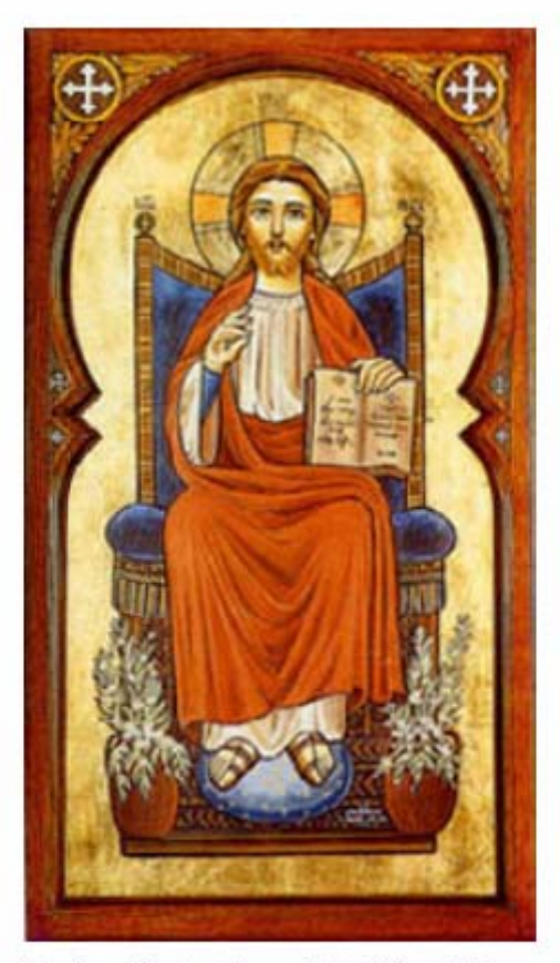
Our Lord and Saviour Jesus Christ, King of Kings and Lord of lords